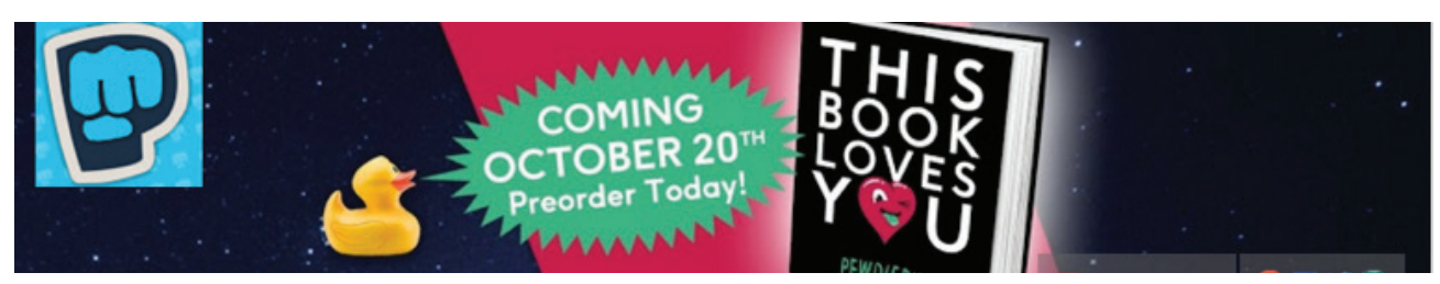
Figure 1. Kjellberg's logo and advertising on his banner

The current author analyzed the layout of the three Youtubers' landing page. Both Sugg and Kjellberg featured logos on their channel. On the other hand, instead of logos, Helbig displayed in a banner her uploading schedule and a slogan that stated, "What a Charming Idiot." Only Kjellberg displayed advertising on the landing page of his channel. For example, his banner advertised his book, This Book Love You , which was released in October 2015, as shown in Figure 1 . A commercial did not play before Kjellberg's newest video. Instead a banner advertisement was displayed at the bottom of his video. On the other hand, Sugg and Helbig displayed an advertisement in their most recent videos before the clip began.